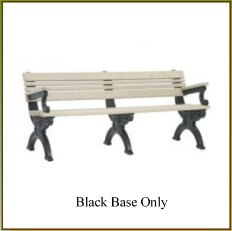
Black Base Only